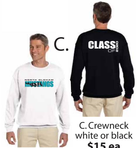
C. Crewneck white or black $15 ea