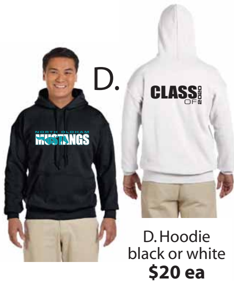
D. Hoodie black or white $20 ea