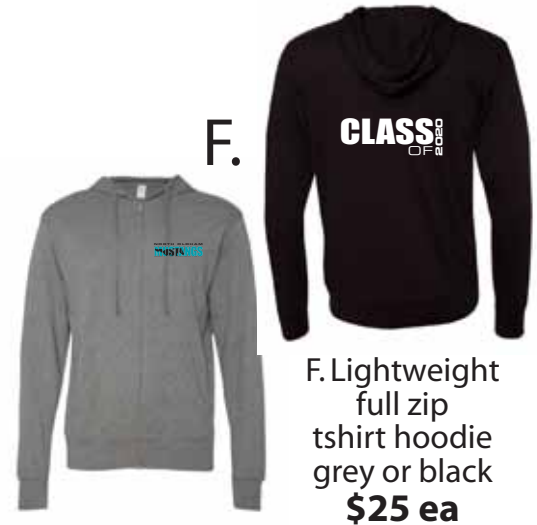
F. Lightweight full zip tshirt hoodie grey or black $25 ea