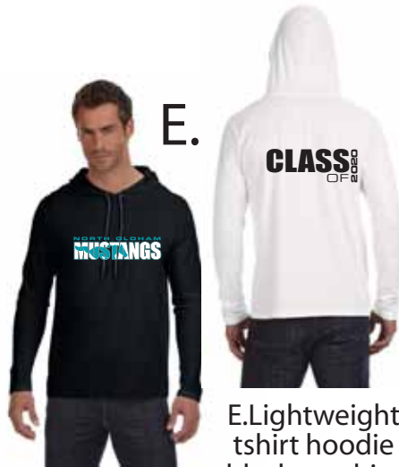
E. Lightweight tshirt hoodie black or white $20 ea