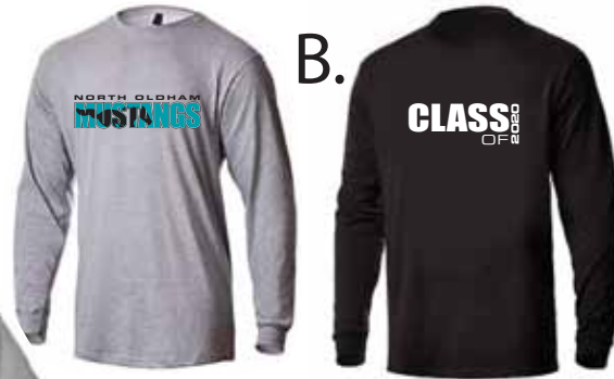
B. TULTEX super soft long sleeve tee grey or black $15 ea